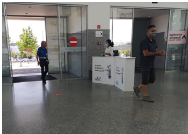
Figure 3. First version of the desk for body temperature measurement at the Hospital main entrance.

The use of phone and video consultations had become increasingly more prevalent on the way we dealt with our patients, whenever possible. From April to June 2020, 24 161 medical consultations were made in the Hospital, of those 10 839 were tele-appointments (45%). Some departments made the majority of the appointments telematic (Anesthesiology – 97%, Pediatrics – 81%, Cardiology – 73%, Psychiatry – 70%, Internal Medicine – 69%, Urology – 65% and Neurology – 64%) and for other Specialties it was marginal (Ophthalmology – 0.1%, Immunohemotherapy – 3%, Gynecology/Obstetrics – 3.5% and Physical Medicine and Rehabilitation – 5%). The rest of the