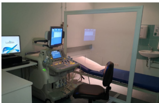
Figure 4. Acrylic wall to make ultrasonographies.

departments made approximately two fifths to one third of consultations by telematics.