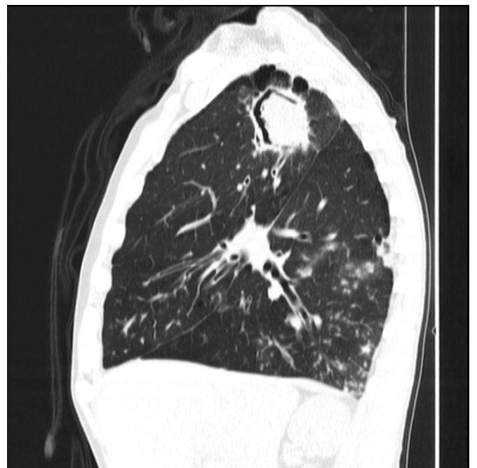
Figure 4. A mass (mycetoma) inside a cavity in axial plane on CT thorax scan