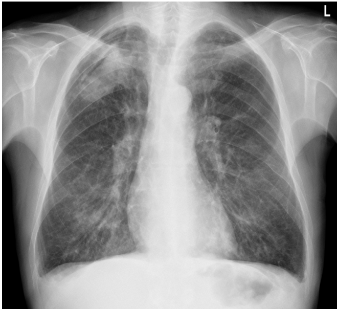
Figure 1. Nodule in upper right lobe on thorax radiography

differential diagnosis with tuberculosis. 1,2 Diagnosis requires 3 conditions: persistent symptoms for 3 months at least, radiological findings compatible with aspergillosis for 3 months at least and direct evidence of Aspergillus infection, that can be on culture from biopsy or in the presence of IgG for Aspergillus , after exclusion of alternative diagnosis. 2 A culture from sputum or bronchoalveolar lavage does not contribute to the diagnosis as it may be related to colonization. 1,2 First line treatment is voriconazole or isitraconazole 3 for a minimum of 6 months in patients with local and systemic symptoms or with progressive loss of lung function. Lung resection should be considerate, especially in patients with hemoptysis. 2,4 Without treatment, mortality rate is higher than 50% within the first year, however with prompt treatment, prognosis improves significantly. 5