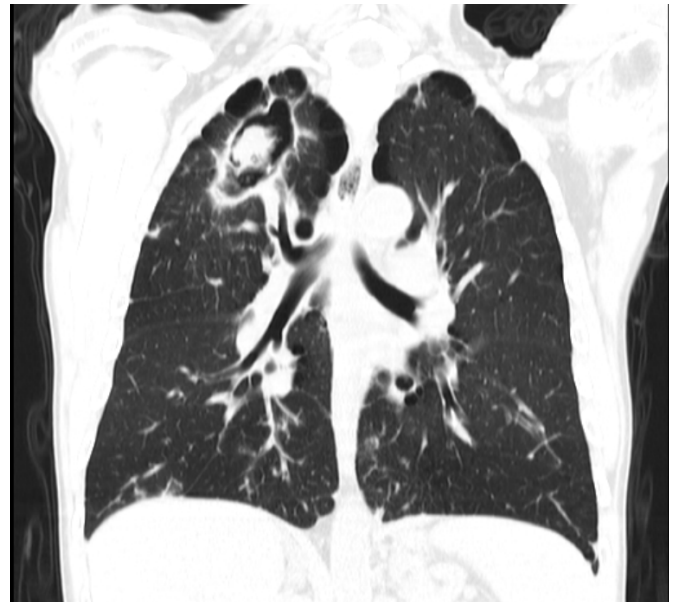
Figure 3. A mass (mycetoma) inside a cavity in sagittal plane on CT thorax scan